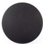
black grill (option)