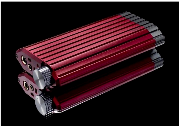
Left The iDSD Diablo 2's grooved aluminium enclosure delivers distinctive form and practical function

The 22 grooves are not just for show; they aid thermal dissipation and double as fixing rails for the devilish ‘wings’ supplied with the iDSD Diablo 2. These detachable appendages act as a desk stand and can be positioned in different ways, allowing the Diablo 2 to be placed horizontally or vertically as its owner prefers. Versatile, desirable and fiendishly clever, the Diablo 2 makes a striking statement even before you switch it on.