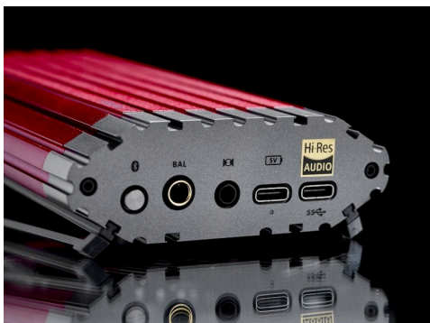
Left The iDSD Diablo 2's crimson aluminium enclosure sports a grey polymer end piece to aid Bluetooth signal reception

As well as being the first portable DAC to support aptX Lossless, the iDSD Diablo 2 is the first to include Bluetooth version 5.4 – the newest Bluetooth standard, announced earlier this year. This ensures the greatest wireless range and stability, highest speed and lowest latency between the source device and the DAC. The Diablo 2 stores up to eight paired Bluetooth source devices in its memory, making it easy to switch between them.