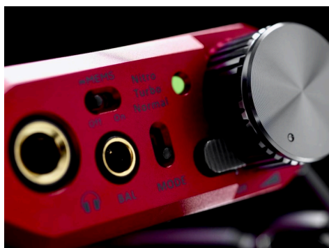
Left Expertly engineered for pure performance, the iDSD Diablo 2 looks and feels unequivocally 'high end'

MQA – the hi-res streaming technology, as used by Tidal's 'HiFi Plus' tier – is comprehensively supported, with full decoding/upsampling of MQA files right up to the format's highest 384kHz specification. Full decoding means that the full 'three unfold' decoding process is performed internally, as opposed to only the final unfold in the manner of an MQA 'renderer'.