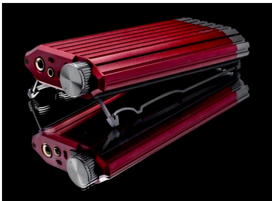
Left Like a sprinter about to explode from the blocks, the iDSD Diablo 2 raised on its desk stand is a vision of compact power and poise

The amp stage supplies three gain settings to suit the drive requirements of the connected headphones or IEMs. The default mode is Normal (0dB); from there you can step up to Turbo (+8dB) or Nitro (+16dB). There is also an IEMatch attenuation mode – this is particularly useful with super-sensitive IEMs, removing potential background noise and increasing the usable volume range. Volume is controlled by a high-quality analogue potentiometer, which delivers superior sonic transparency compared to chip-based volume controls and can be locked in place to avoid accidental adjustment.