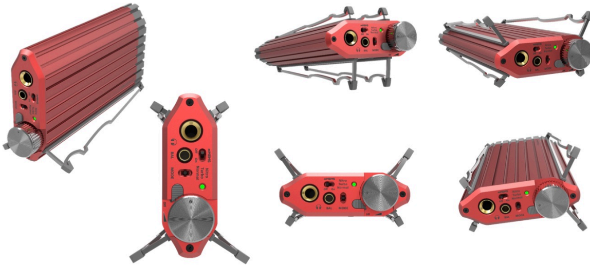
Above The detachable ‘wings’ can be positioned in various ways, allowing the iDSD Diablo 2 to stand vertically or horizontally