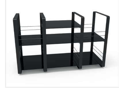
1 main unit / 2 side units Black finish