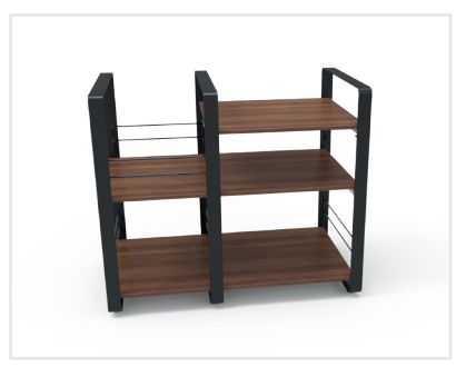
1 main unit / 1 side unit Walnut finish

Net weight: Bamboo: 22.4 kg / Walnut: 22.1 kg / Black: 30.3 kg Gross weight: Bamboo: 25.7 kg / Walnut: 25.4 kg / Black: 33.6 kg