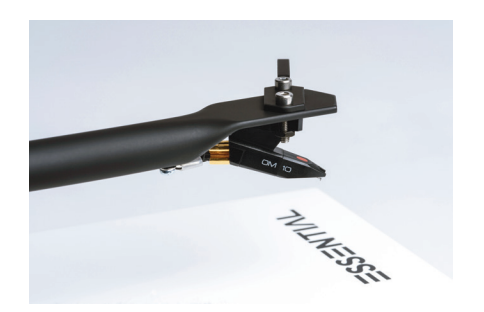
One piece 8.6" aluminum tonearm Cartridge: Ortofon OM10

The grade OM10 pickup top pioneer Ortofon will guarantee for sonic pleasures all around. Essential III SB delivers lively, balanced and highly involving sound that will delight every vinyl lover. Essential III SB comes in the aesthetic high-gloss colors black, red and white.