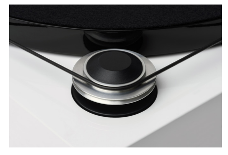
Diamond-cut aluminum drive pulley: precise power transmission