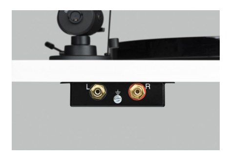
High quality gold-plated RCA sockets