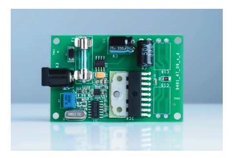
Built-in DC-powered motor control: better speed stability with minimized speed drift