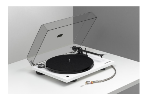
Dust cover, felt mat and high quality connection cable Connect-it E included