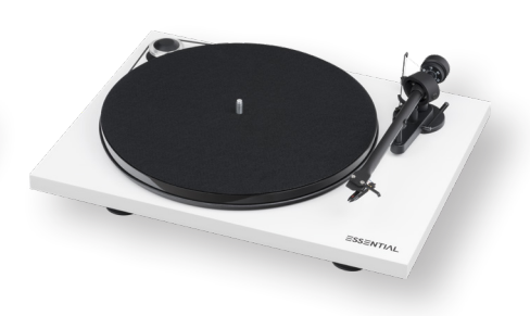
HG red HG white