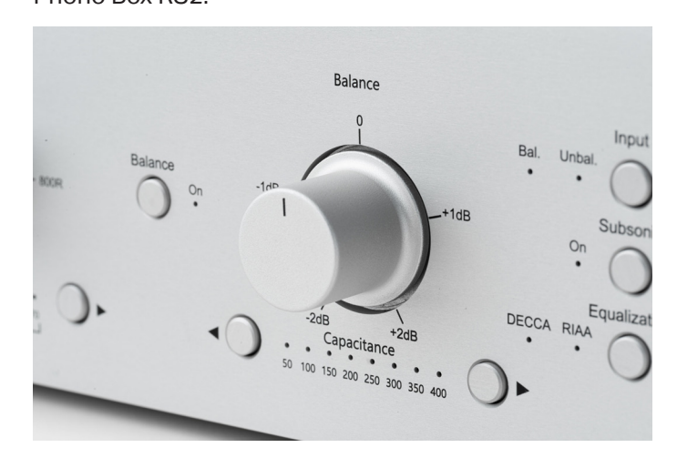
Practically, there is no MM or MC cartridge that the Phono Box RS2 can't handle.

Cartridges, by nature, suffer from small imbalances between the left and right channels. To correct this the Phono Box RS2 introduces a new feature that is absolutely rare in this price category. A potentiometer allows you to adjust the exact center of the sound stage in ranges of 2dB to the left or right. This function can be switched off in order to keep the signal path as short as possible, or if it is not needed. For example, Ortofon declares that their very popular cartridge 2M Red has a channel balance of 1,5dB at 1kHz. Their very expensive MC cartridge Anna Diamond has a channel balance of, still, 0,5dB. These small differences can be accurately balanced by the Phono Box RS2.