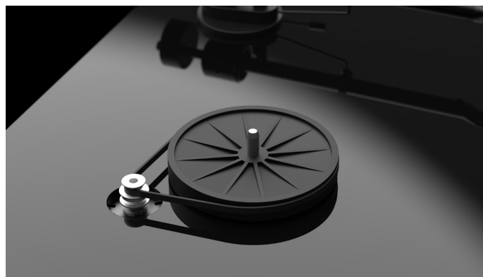
Ultra-precise motor and sub-platter design Lowest noise with immaculate speed stability

In the T1, the motor drives a belt-system, attached to a newly designed sub-platter, which is mounted into an ultra-precise 0.001mm main bearing with a hardened steel axle and brass bushing – just like our coveted Essential III turntables.