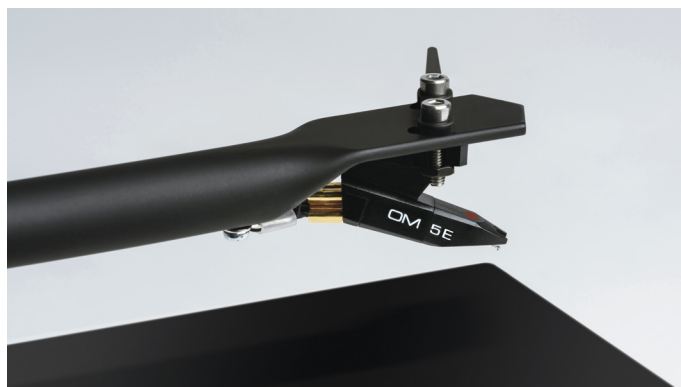
High-quality Ortofon OM 5E Moving Magnet cartridge with elliptical stylus tip

The T1 is a new affordable marvel. Still made in Europe by a turntable factory with decades of experience, it is a true hi-fi turntable that looks and sounds sublime.