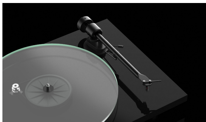
One-piece aluminium tonearm Robust and stiff construction for pure sound fidelity

Alongside the chosen motor system, the T1 is therefore able to ensure a smooth, anti-resonant rotational platform for the tonearm and cartridge to ride across.