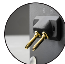
Gold plated banana connectors