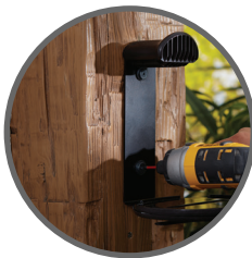
Weather resistant construction