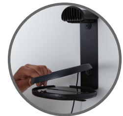
Can be used with or without charging ring