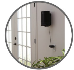
Frees up counter and table space