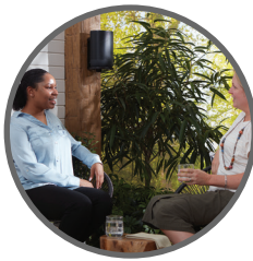
Positions speaker at ideal height