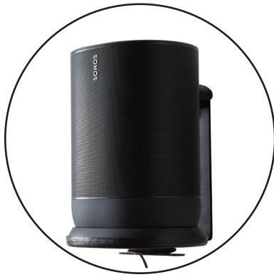
Designed for Sonos Move™ Speaker