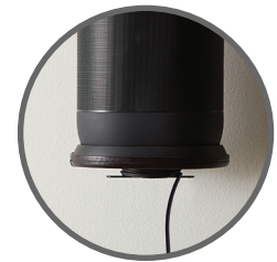
Hidden built-in cable management spindle for wrapping excess cord